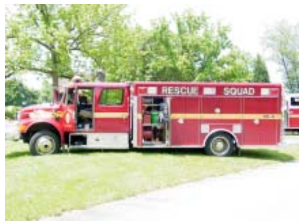
Montgomery County Fire Department