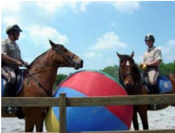
Crowd Control Demonstrations