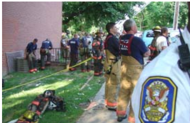
Firefighters assess situation.

I was truly impressed with our Division's actions at this incident. With an event of this magnitude, numerous lives were in jeopardy. Everyone worked together quickly and efficiently to bring the incident under control. Fire/Rescue command staff made a number of positive comments about our Division's personnel and actions. I commend everyone for his/her professionalism and quick response to this unfortunate incident. G