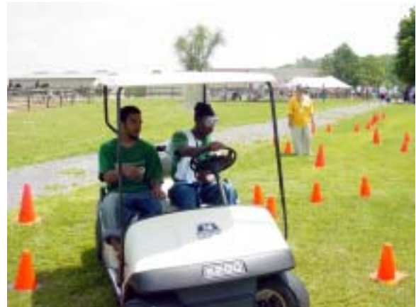
Fatal Vision Rides